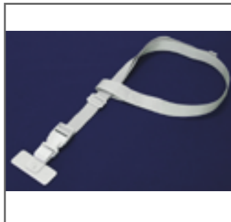
Adjust strap length at buckle