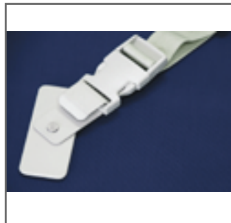
Use with adhesive Swivel "T" Clip