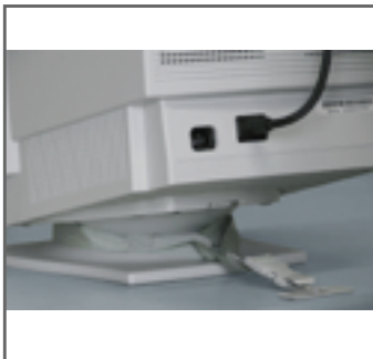
Wraps around neck of monitor