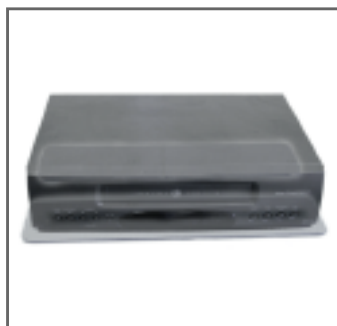
QM 0414G under a VCR