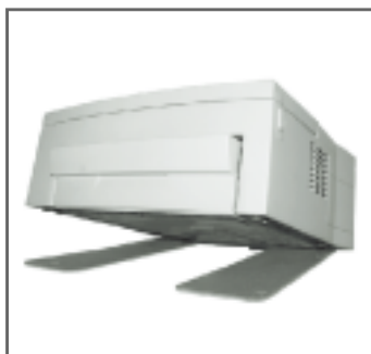
Simply place QuakeMat™ under item to be fastened