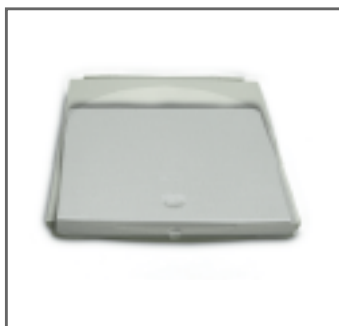
QM 1012G under a scanner