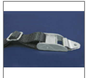
Swivel mounting cam buckle

Adjustable/detachable furniture straps are constructed of high strength nylon webbing with a steel end buckle sewn onto one end and a special swivel mounting cam buckle on the other end. The cam buckle automatically locks the strap in place after it is pulled to size. The straps are easily connected and disconnected when moving furniture to access wires or electrical outlets. In most cases these straps can be installed out of view for better aesthetics.