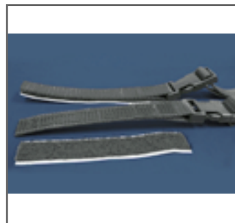
Available in 5 colors