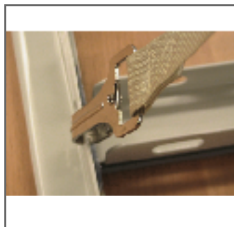
Steel snap hook easily attaches strap to track