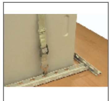
Strap is adjusted with the steel cam buckle

The ServerTrac™ system allows quick and easy adhesive-free securing of equipment to countertops. All components are completely reusable and all straps adjust to suit changing needs.