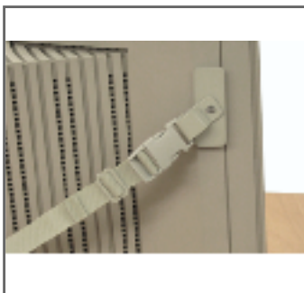
"Quick-release" buckle for instant access