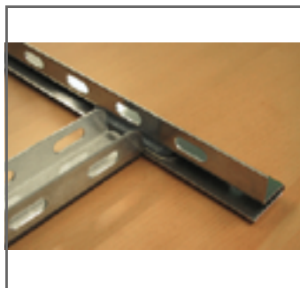
Side Track slides into place in back track