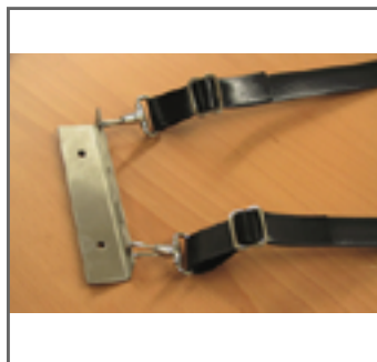
Stainless steel snap hooks and LabTrac plate