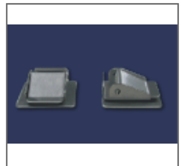
Adhesive swivel cam buckle

This TekStrap™ Swivel Cam Fastening Kit is a unique product designed to secure medium to heavy countertop lab equipment such as incubators, centrifuges, analyzers, mixers, etc.