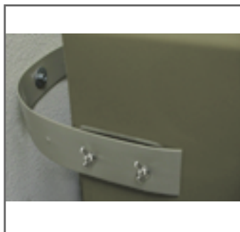
Discreet and effective strapping method