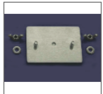
Stainless steel hardware

This kit is ideal for securing large appliances or furnishings in laboratory or clean room environments because of its' cleanliness and easy installation/removal. TekStraps are made of a special non-corrosive and non-porous coated material that does not absorb liquids and prevents the growth of fungus and bacteria.