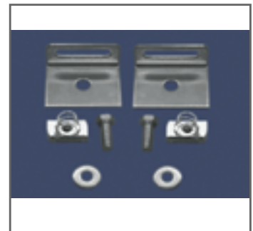
Stainless steel end plates