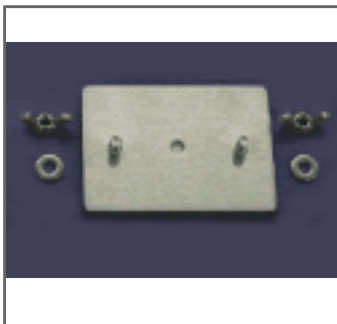
Stainless steel stud plates and hardware