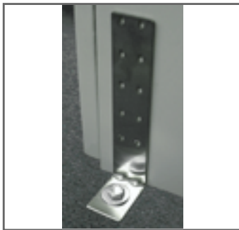
Stainless steel brackets & plated steel hardware