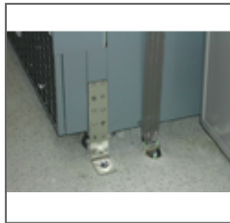
Can be combined with other fastening kits