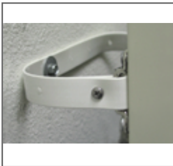
Can be mounted on top or side of item