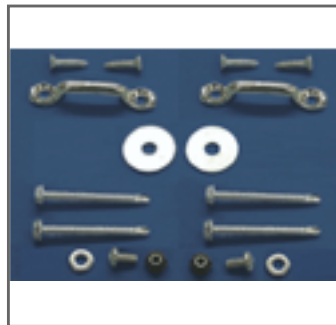
Kits include all hardware