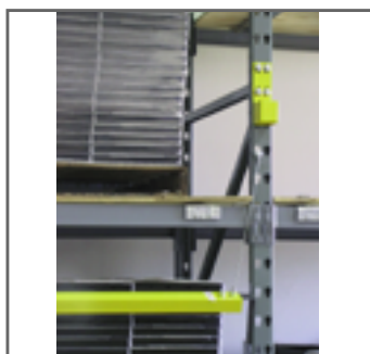
Adjustable safety cable