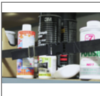
Tight strap prevents even loose items from falling